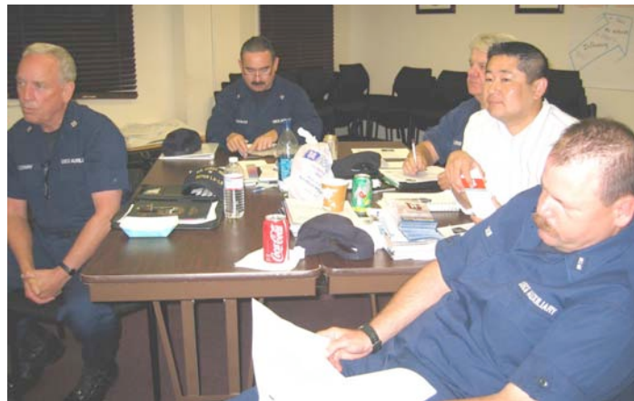
Div. 5 Staff Officers at meeting 4/20/10