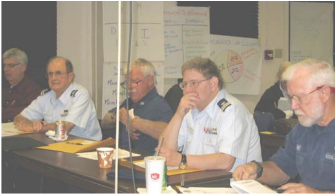
FC's at Div 5 Meeting 4/20/10