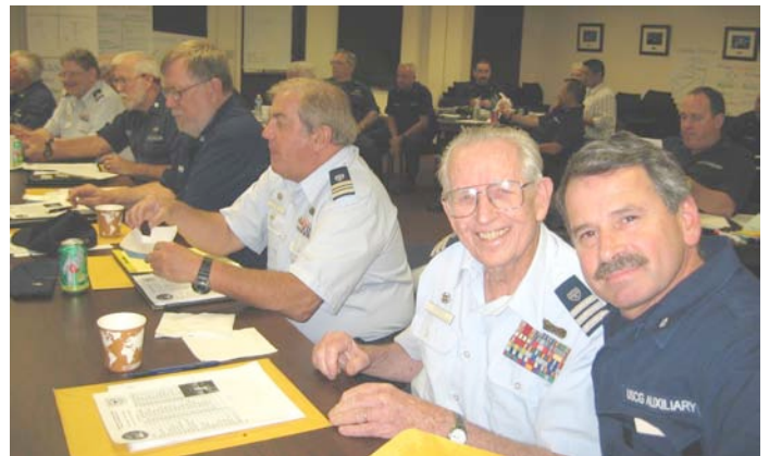
Div. 5 FC's at Meeting 4/20/10