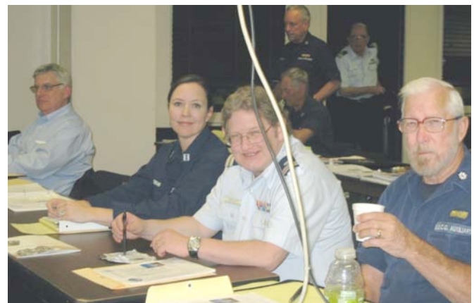
Flotilla Commanders for Division 5