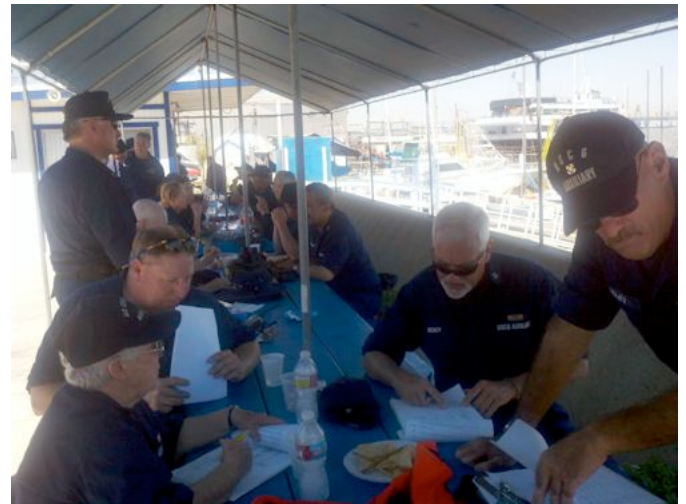
To view more pictures see Div. 5 website